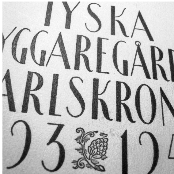
THE SOURCE OF INSPIRATION; A HANDMADE HEADLINE TYPEFACE FROM A SWEDISH BOOK ABOUT THE KARLSKRONA BREWERY.